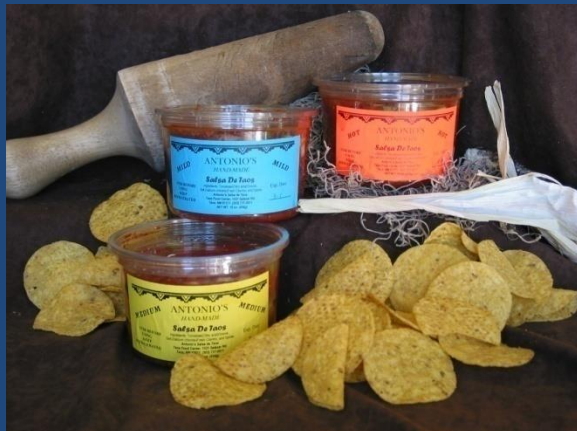
Antonio's Fresh Salsa