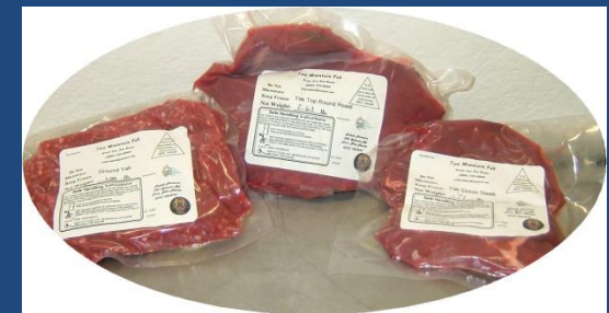
Mobile "Matanza" Meat Product