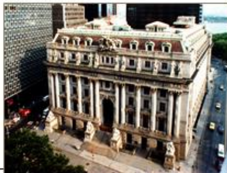
New York, NY